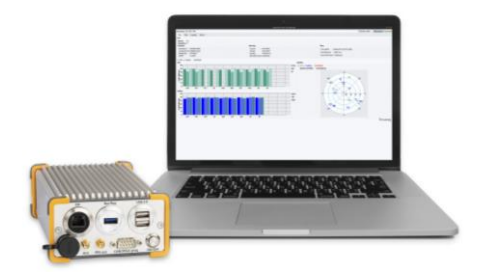
GOOSE User Interface