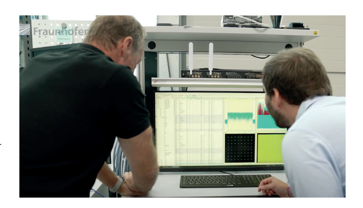
Our experts are ready with their expertise to fulfill your individual testing requests.

Venture further into the world of 5G testing with our additional testbeds - Automotive Testbed, Nomadic Positioning Testbed and Mobile Campus Network. These specialized testbeds promise unique insights and tailored solutions, expanding the horizons of your testing experience. Explore the next frontier in connectivity, positioning and testing with our diverse testbeds.