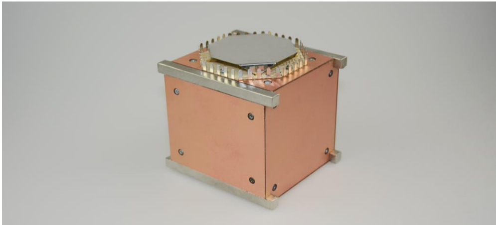
Figure 1. Prototype (Mounted on a 1U Mockup)