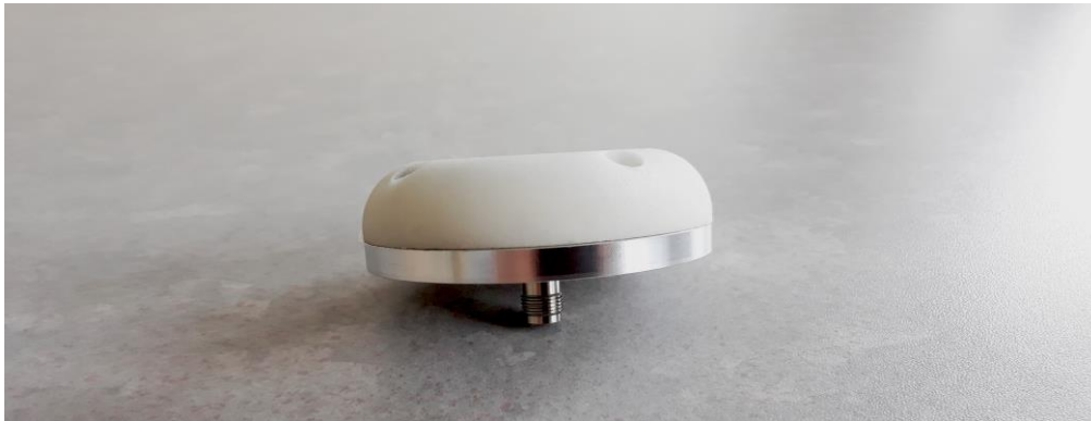
Figure 1. Prototype